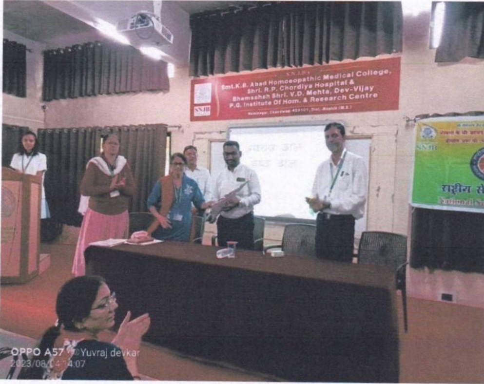
OPPO A57 Yuvraj devkar 2023/08/04 14:07