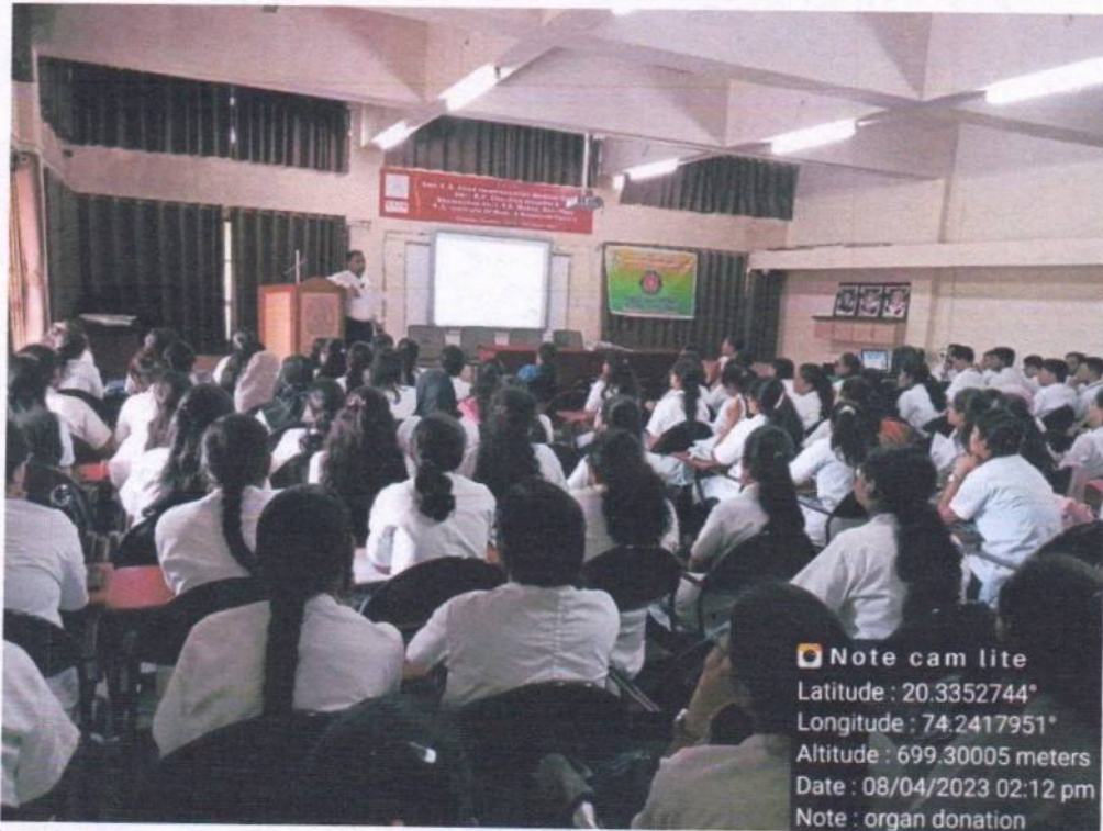
Note cam lite Latitude : 20.3352744° Longitude : 74.2417951° Altitude : 699.30005 meters Date : 08/04/2023 02:12 pm Note : organ donation